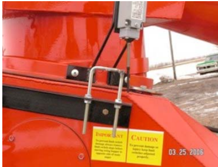
Whisker catching stop tab at least 1 1/4" or more

auger boot, depending upon which side you choose for the hopper. With the hopper still in its home position, slide the switch stop in the slot rearward (toward main auger) until the cross bar on the limit stop comes in contact with the whisker of the limit switch. The cross bar should contact the whisker at least 1 1/4" or more. If the whisker does not contact the stop bar enough it will slip over the stop tab and the hopper will not stop. The whisker should also be close to centered horizontally on the stop tab. If for any reason these positions cannot be achieved with adjustment contact Rust Sales, Inc. immediately. Rust Sales, Inc. will not be responsible for any damage caused by improper adjustment of limit switches.