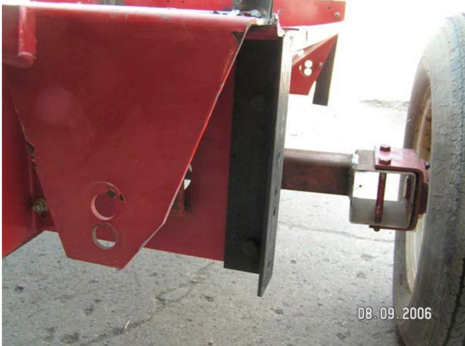
Picture showing the outside 10" angle iron mounted to hopper with 2 3/8"x 1" bolts and nuts.

Take the pillow block bearing assembly and hold them vertically and flush to the bottom of the angle iron mounts. {Mounting the pillow blocks flush should keep the hopper at the same height as before.} Mark the holes. Then drill two 3/8" holes to mount each pillow block.