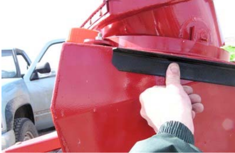
Bracket 4" from front of boot

Having a bracket on either side of the boot will allow you to use the automatic shut off system, no matter what side your swing hopper is on. You will only be using the front bracket and one side bracket, at any given time, while in operation. If the other limit stop is in operating position it might contact the swing hopper tube. Attach the other limit switch stops on the side brackets with the tab towards the main auger and the long side of the tab away from auger boot.