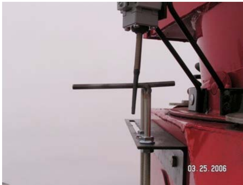
Side stop with long tab away from boot

Having a bracket on either side of the boot will allow you to use the automatic shut off system, no matter what side your swing hopper is on. You will only be using the front bracket and one side bracket, at any given time, while in operation. If the other limit stop is in operating position it might contact the swing hopper tube. Attach the other limit switch stops on the side brackets with the tab towards the main auger and the long side of the tab away from auger boot.