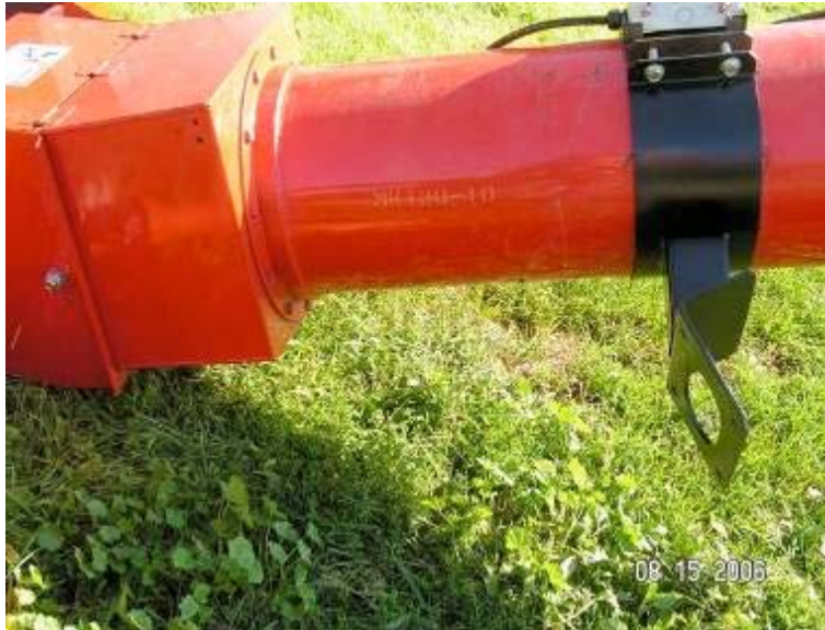
Picture showing proper mounting of motor mount- 15- 20" from intake of hopper

Place the motor mounting clamp around the auger tube approximately 15-20" from the intake of the hopper as shown in picture below. Use four 7/16" x 2" bolts to secure clamp to the auger tube.