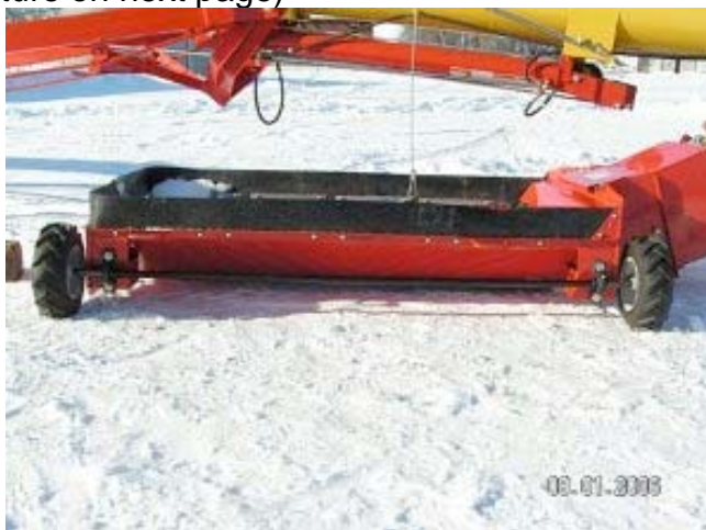
Similar picture showing bearings and axle and wheels assembled

After getting holes drilled, mount pillow blocks with four 3/8 x 1-1/2" and slide the axle shaft in to the bearings. Slide the hub and wheel assemblies on to the ends of the shaft. Position shaft so that the tires clear the hopper by 1" and leave 2-4" of shaft sticking past inside tire so the driveshaft can be mounted. Align wheel hub and shaft keyways, install 1/4" key and tighten both wheels to shaft. Tighten both bearings to axle shaft. Cut the yellow axle protector to fit between the 2 pillow block bearings and slip on to the shaft. (picture on next page)