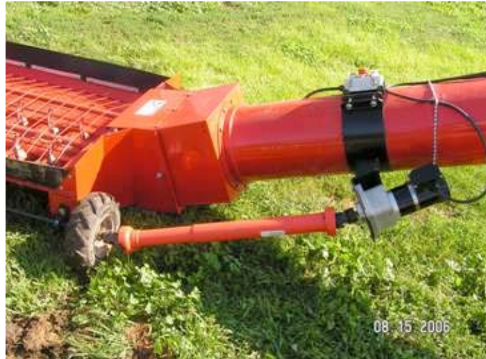
Complete motor and driveshaft and shield installed

Install drive shaft assembly to the motor and axle shaft with keys. Tighten the set screws on the motor and axle shaft. Be certain that the drive shaft shield covers the drive shaft completely.