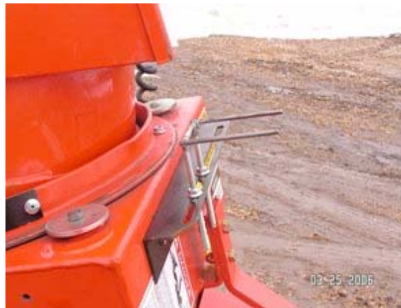
Proper position of the front stop with tabs facing away from auger boot.

The other two brackets will be placed on each side of the main auger boot. Position each of the two brackets on the sides of the boot - parallel to the top of the auger boot. The brackets can be dropped down approximately 1/4" lower than the top of the boot. Position the bracket starting at 4" from the front of the boot. Drill 2 1/4" holes through the bracket and the boot, one at the beginning of the bracket and the other one should be as far forward as possible but still be able to bolt it to the side of the boot.