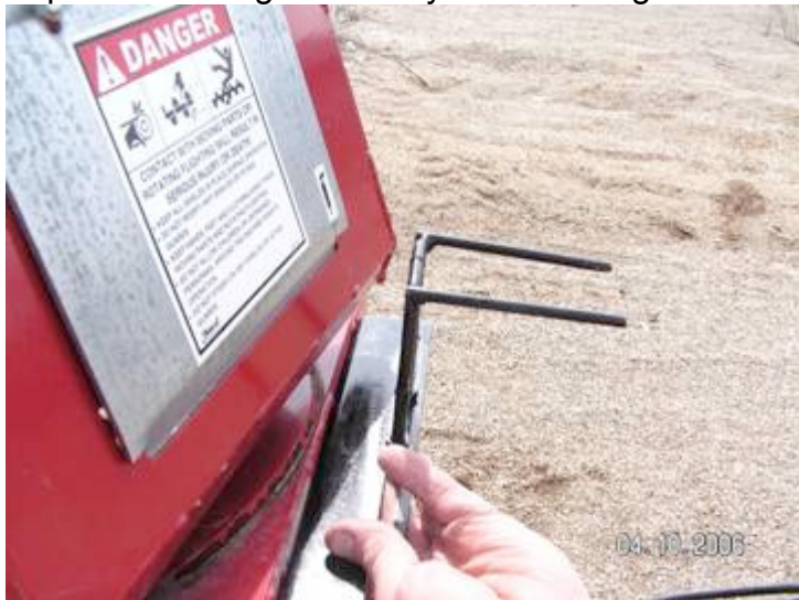
Picture showing front stop with stop tabs away from boot.

The limit switch stop used in this bracket will be the one with 2 stop tabs on it. Position this stop with the long tabs away from the auger.