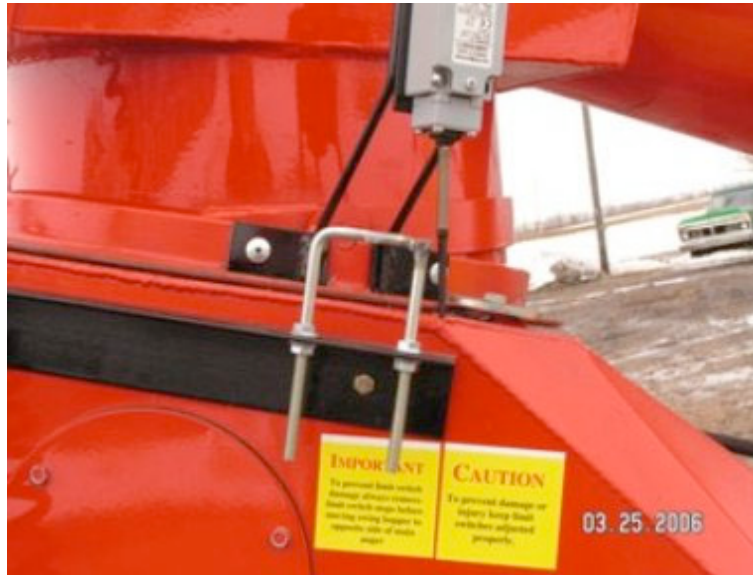
Whisker catching stop tab at least 1 1/4" or more

IMPORTANT-- The point at which the swing hopper tube will come into contact with the main auger tube {home position} will vary depending upon the height of the main auger, so set limit switch stops accordingly.