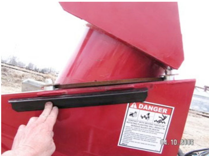
Picture showing proper position of side bracket on auger, 5"-6" from front of boot

The other two brackets will be placed on each side of the main auger boot. Position these brackets on the side of the boot parallel with the top, dropped down approximately ¼", starting 5"-6" from the front of the boot. Drill 2 ¼" holes on each end of bracket and through the side of boot and mount with 2 ¼" x ¾" bolts and nuts.