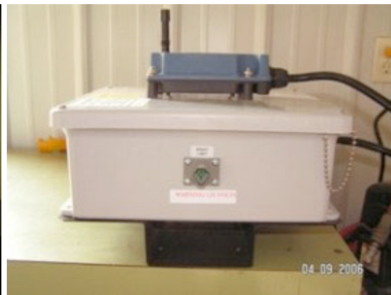
Control box on the mounting plate