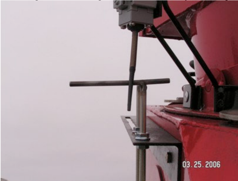
Side stop with long tab away from boot

Attach the side limit switch stops on the side brackets with the tab towards the main auger and the long side of the tab away from auger boot.