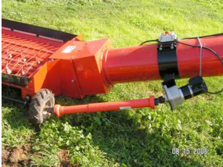
Complete driveshaft and shield installed